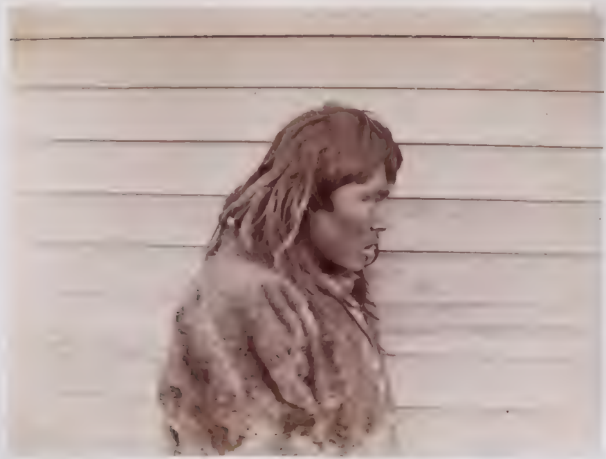
| 26. Male Esquimau, showing clotted hair. |